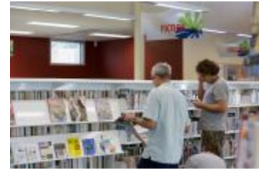
Laugh and have fun!